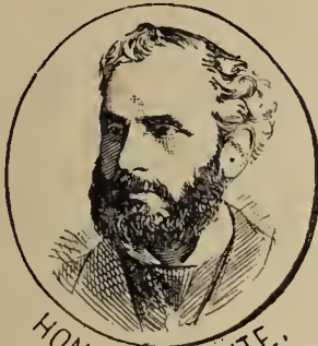
HON. THOS WHITE.